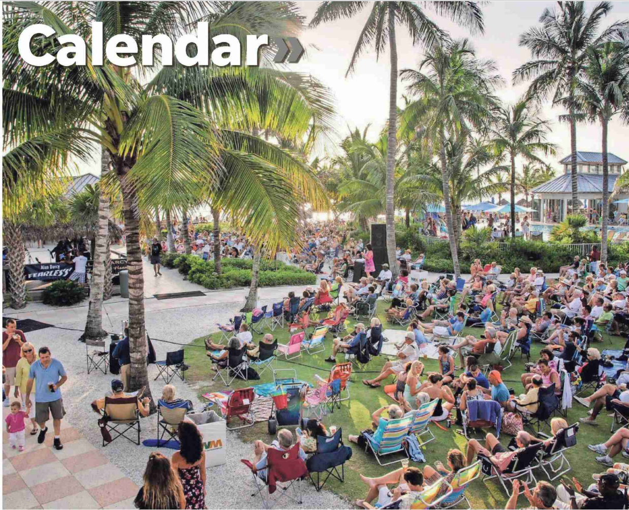
A view of the crowd at a previous Summerjazz show